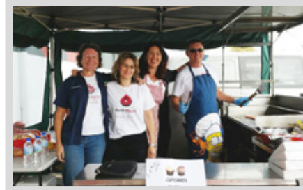
PBI team behind the BBQ.