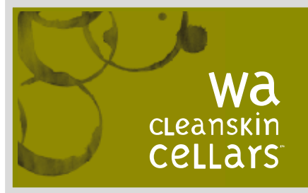
PBI teamed with WACC for producing their own label of WA premium wines.