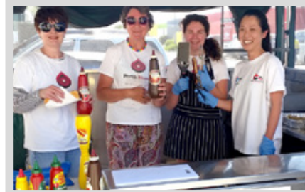
PBI team behind the BBQ.