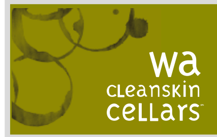
PBI teamed with WACC for producing their own label of WA premium wines.