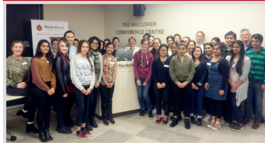
PBI team with year 11 students at Murdoch University on 29/September/2016.

The Perth Blood Institute coordinated a 'medical science encounter' to support high achieving Year 11 Students from various schools, wishing to gain experience in medical research. A ½ day workshop at the Western Australian Centre for Thrombosis and Haemostasis at Murdoch University was held on Thursday, 29th September 2016.