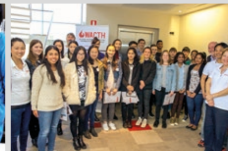
PBI team with year 12 science students at workshop

*The next ½ day workshop for Year 11 students will be during September/October school holidays.