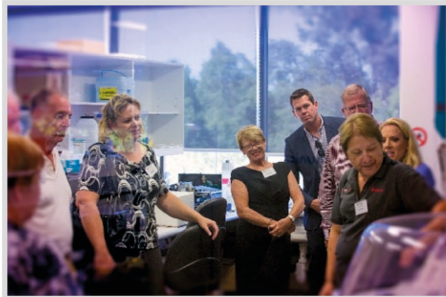
WACTH research team showing clotting factors for benefactors.

Benefactors took a closer look at how the WACTH research laboratory at Murdoch University understand blood clotting factor regulation and the microRNA control of clotting factors.