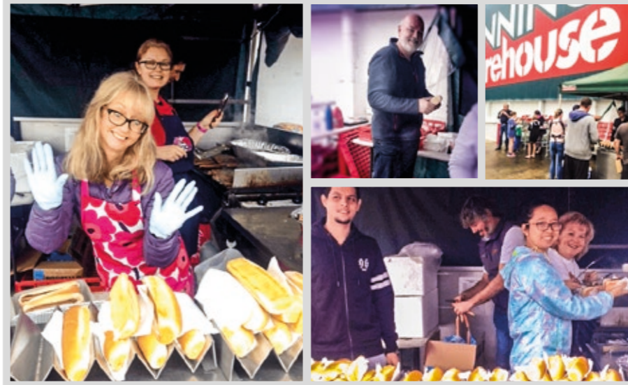
PBI team behind the BBQ. with public supporters.

Thank you to all sizzlers for assisting our fundraiser on Sunday, 20th May at Bunnings Melville . Together with the public's support, we raised over $1,501.00. Thank you in helping us continue to increase